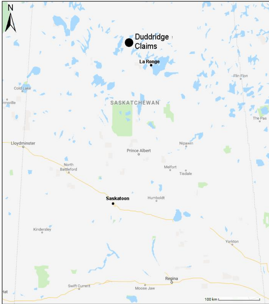
Location of Duddridge Lake claims in Northern Saskatchewan

and 746 ppm V; sample DD12-WM-002 assayed 567 ppm Co and 5,550 ppm V plus 4,440 ppm Pb and 15,100 ppm U.