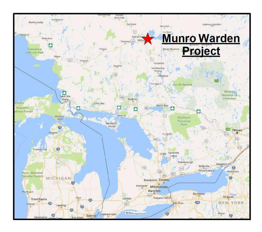
Location of Munro Warden Project in Ontario